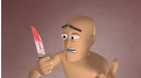
Old school (feb. 2009) personal work.

Animation, wrote the story, lighting and rendering with Maya mental ray.