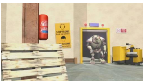
Robot (jan. 2007) personal work.

Animation, wrote the story, lighting, rendering with Maya mental ray.