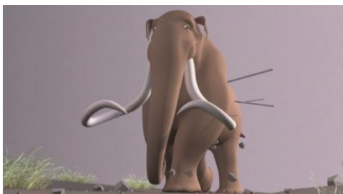
Mammoth (dec. 2008) personal work.

Animation, co-wrote the story, story board, layout, design, matte-painting, face and hair texturing, facial rig of the little girl.