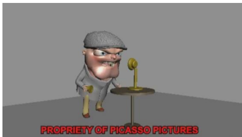
Swear box ( Aug.2007) internship.

Animation, lighting, rendering with Maya mental ray.