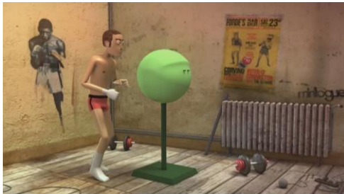
Boxe training (march 2009) personal work.

Animation, wrote the story, lighting and rendering with Maya mental ray.